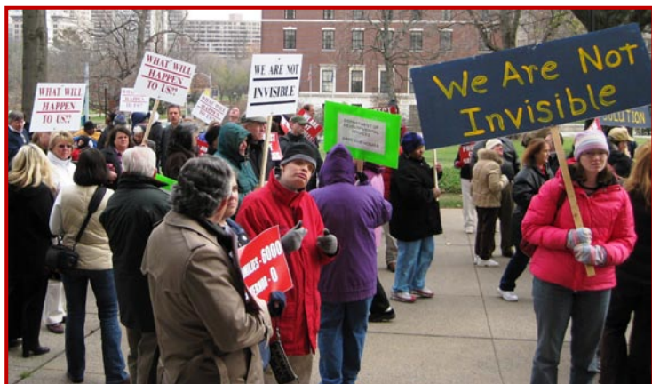
Family, friends, and individuals with developmental disabilities rally outside the Capitol on 11/24.

providers as a result of 25 years of inadequate funding. Parents were interviewed for WPLR 99.1, for the Norwalk Hour, the Newtown Bee, and for a segment on New England Cable News. Thank you to many of you who have encouraged parents and family members to get involved in this advocacy effort.